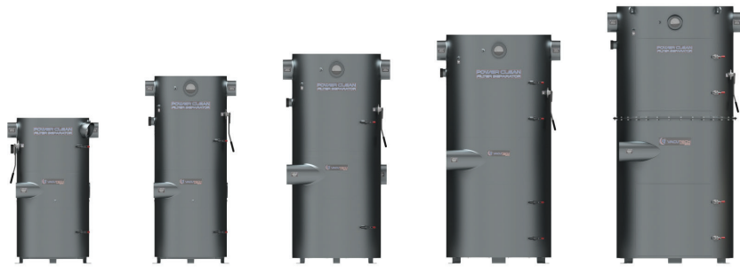
3160 Filter Separator w/o gauge 3160 Filter Separator with gauge 3179 Filter Separator 3888 Filter Separator 4596 Filter Separator