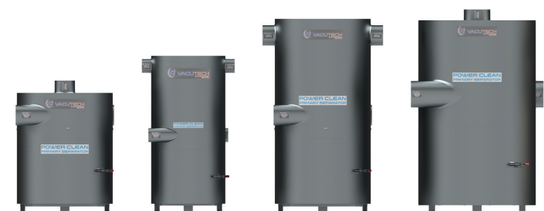
3136 Primary Separator 2448 Primary Separator 3160 Primary Separator 3860 Primary Separator