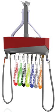
Ceiling-Mounted Detail Valet

The perfect solution for the needs of the professional detailer