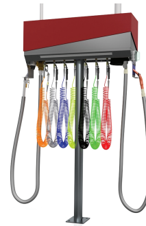
Floor-Mounted Detail Valet